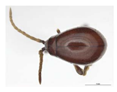
Information current as of 19 March, 2015 For more information visit www.museumpests.net

Eggs are laid in or on the material surrounding the food source. Larvae spin shelters, and pupate